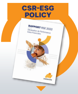
Reinforced expertise in CSR support for companies